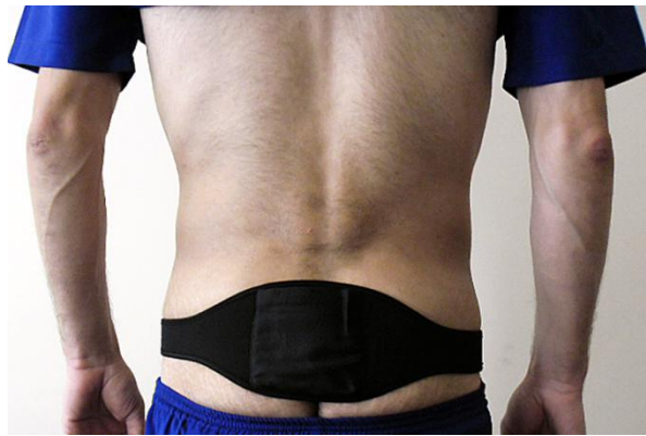
Figure 1: The thermoelement of the therapeutic device is tightly attached to the coccyx area.