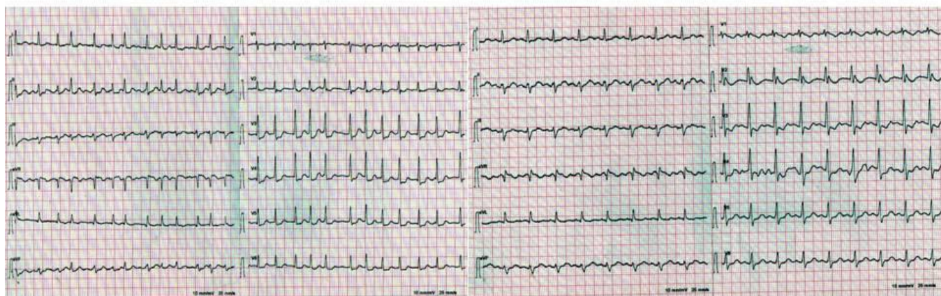
Figure 1: Showing Electrocardiographic tracings before and after pharmacological cardioversion. (A) Twelve-lead tracing shows atrial fibrillation with the fast ventricular response. (B) 12 lead tracing shows sinus rhythm with bi-fascicular block (i.e. LAHB and incomplete RBBB).